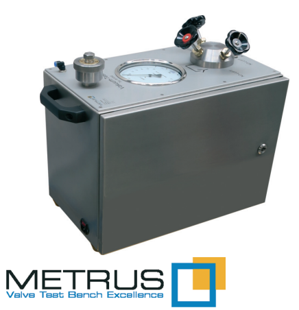
mobile vacuum tester