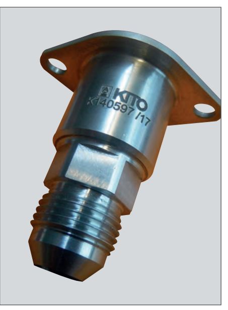
Devices for portable tanks