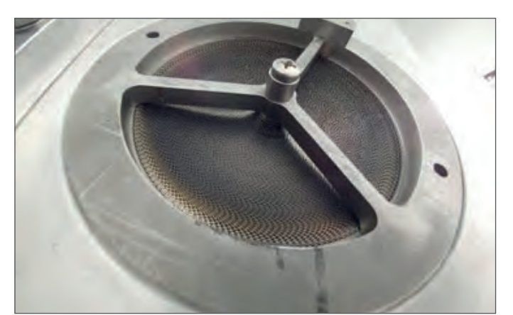
Measuring instruments Housing, enclosures and zones separation