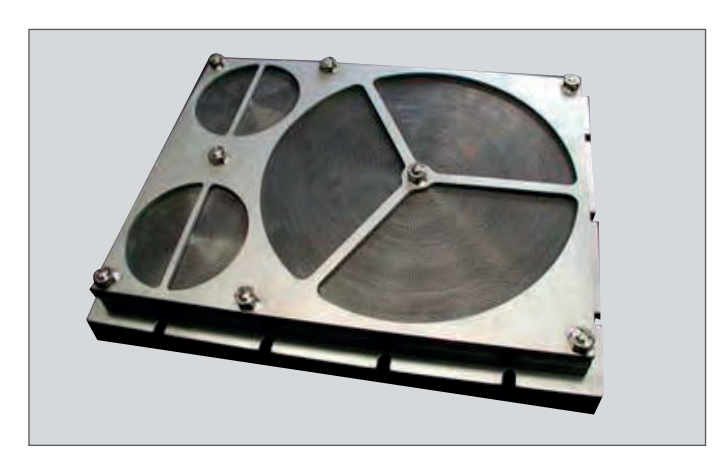
Exhaust gas system

Flame arresters are integrated in a variety of different devices and components. As components they have the task to allow the flow of media, but at the same time to prevent the flame propagation after ignitions.