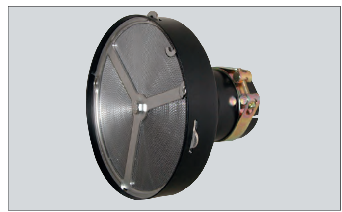
Exhaust pipe protection