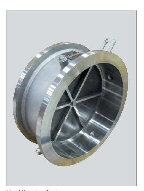
Fluid flow machines (pumps, compressor, and blowers)